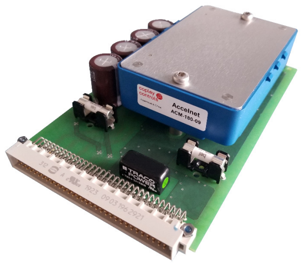
Figure 1: TWE-180-09_Plus